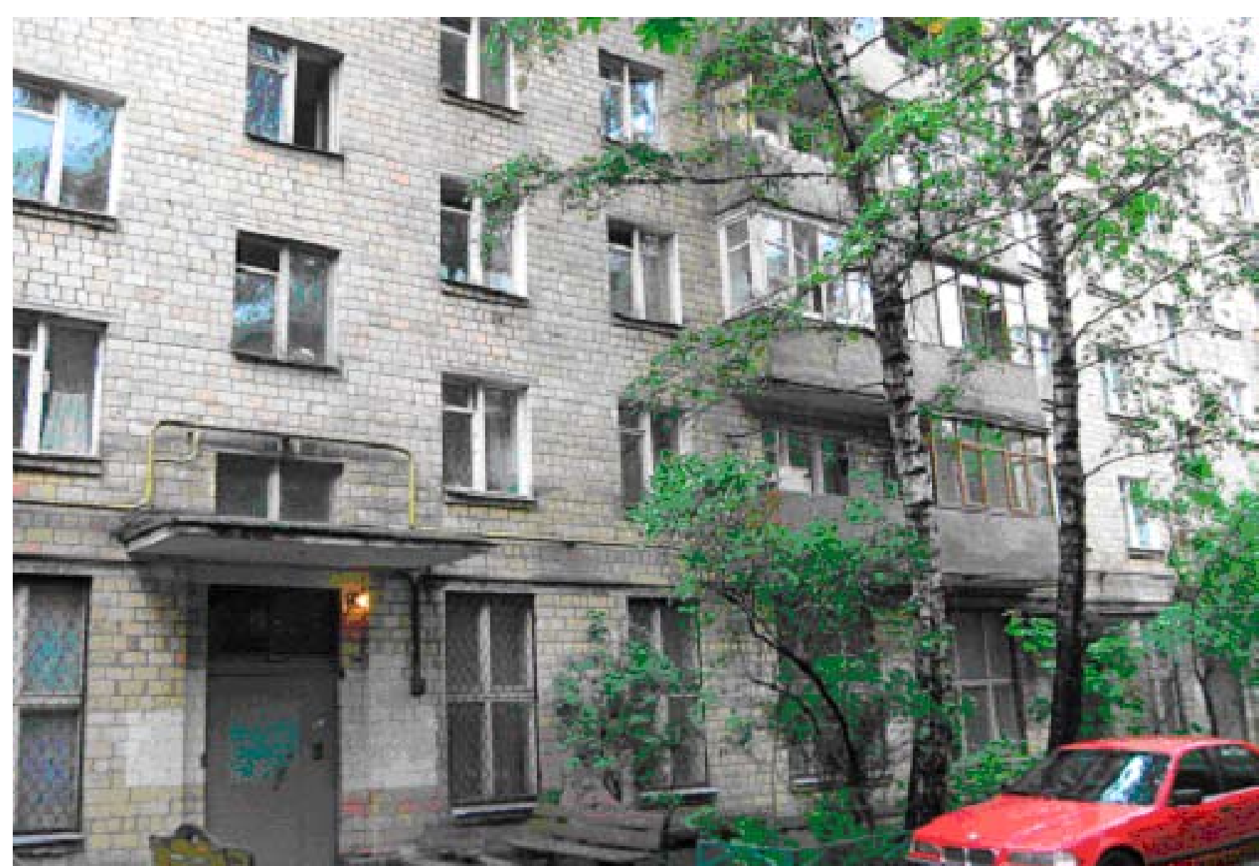
The view of the houses, entrance.

In Moscow housing problem is one of the most actual and critical problem. housing demand greatly exceed it's supply, new houses are build mainly in prime-price segment (average price for one square meter in new building varies around 1500-2000 dollars). In such conditions forced stay-at-home kids phenomenon is widely spread. Adults, sometimes with their families, are to live with parents in one flat and have no opportunity to move to another apartment. This, from our point of view, aggravates relations between children and their parents and intensifies natural difficulties in relations.