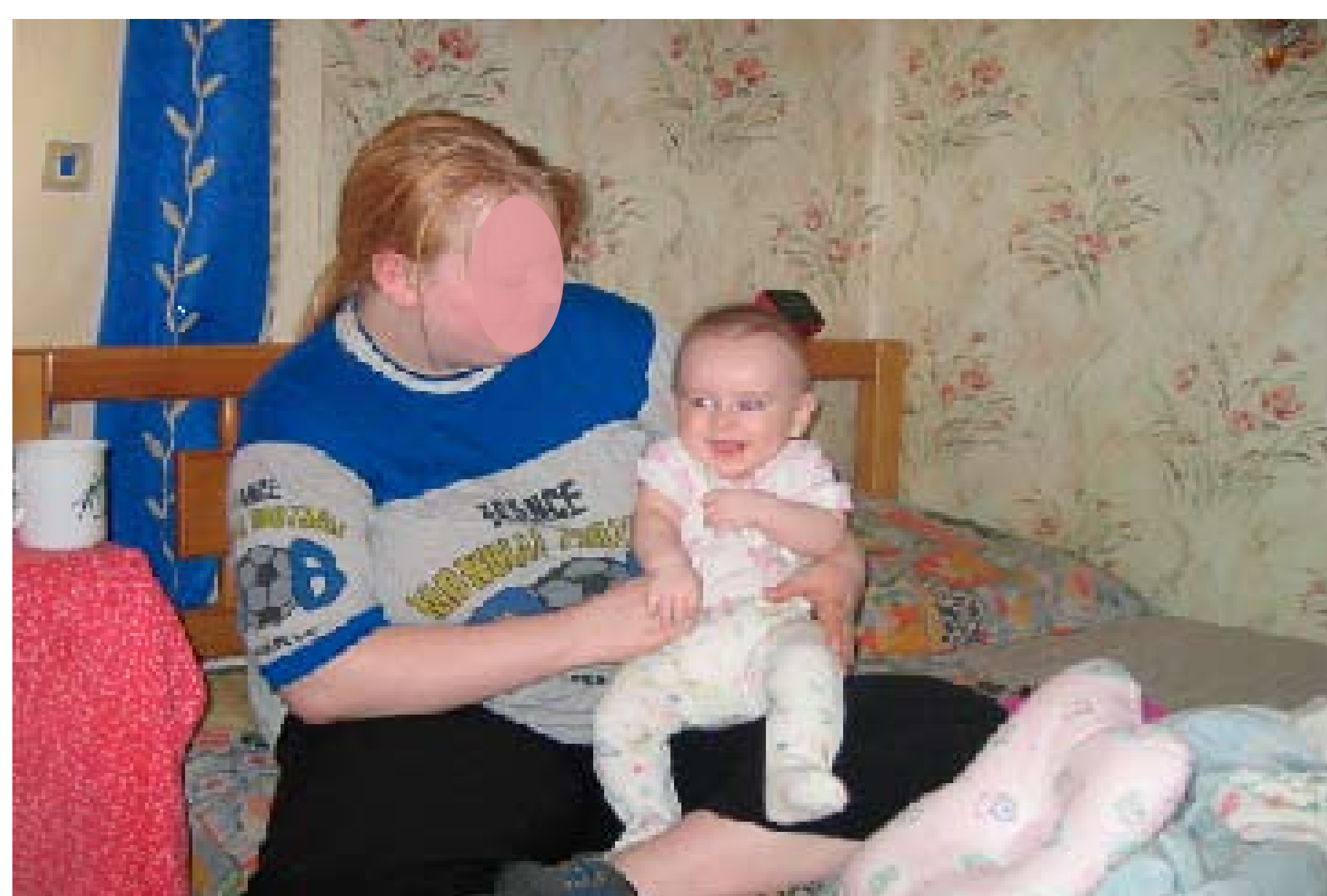
The fragment of the interview [young mother].