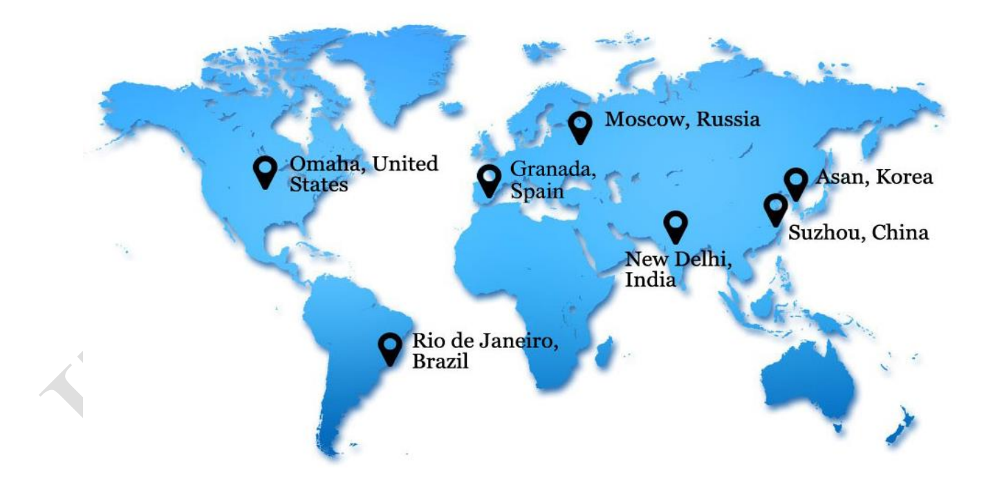
Locations of Previous Conferences Globally