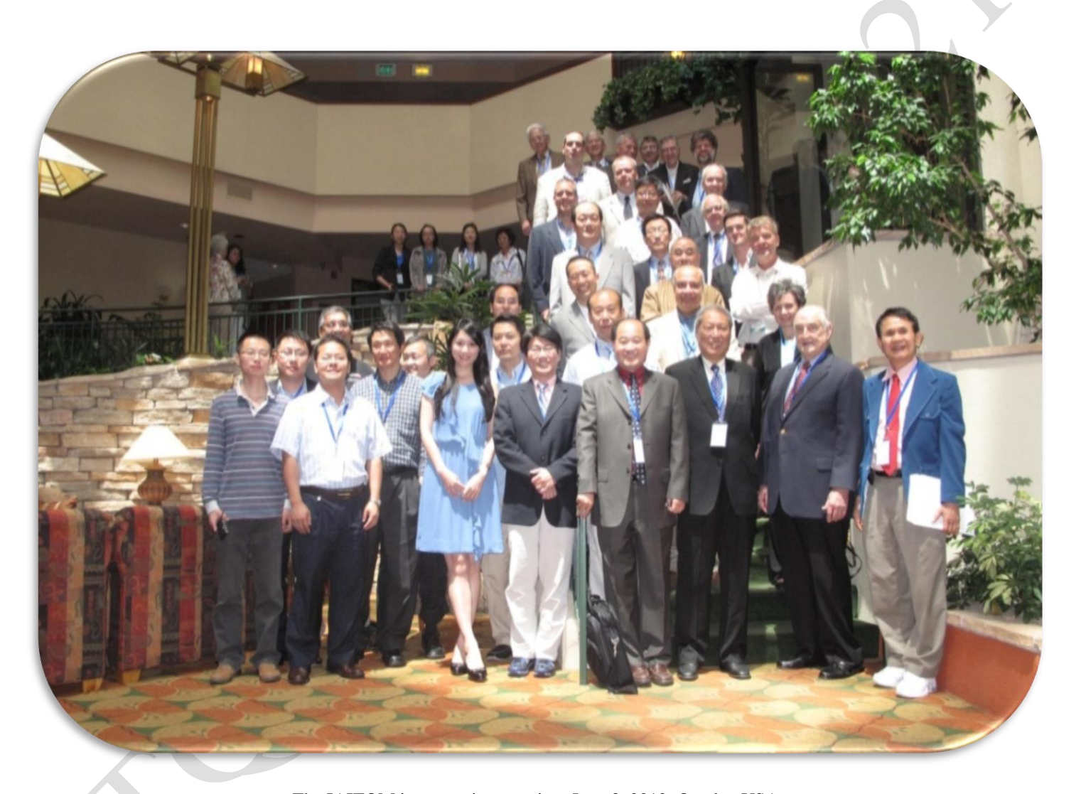
The IAITQM inauguration meeting, June 3, 2012, Omaha, USA