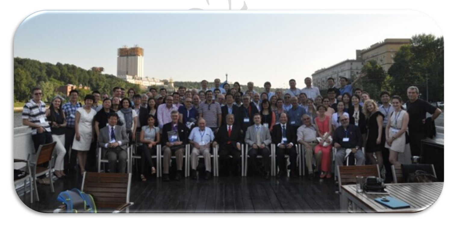
The Second International Conference on Information Technology and Quantitative Management, June 2014, Moscow, Russia