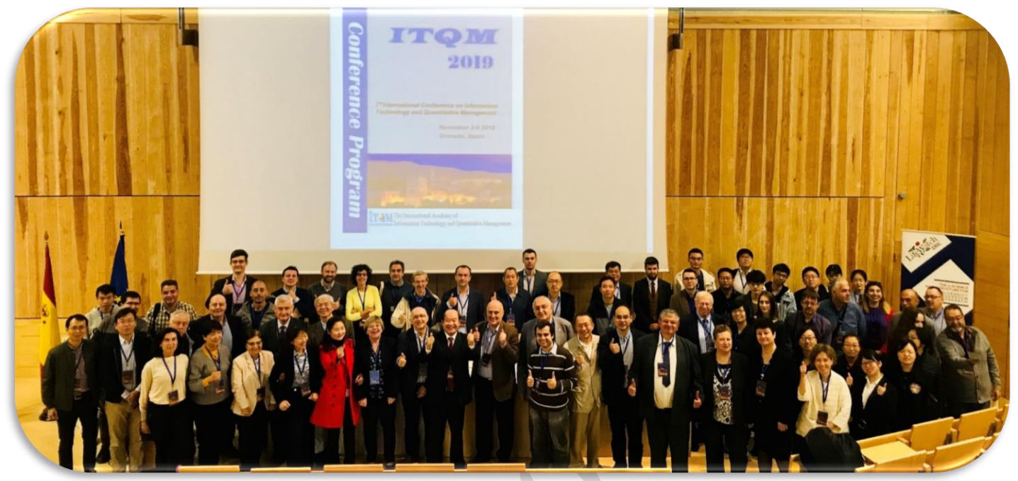
The Seventh International Conference on Information Technology and Quantitative Management, November 2019, Granada, Spain