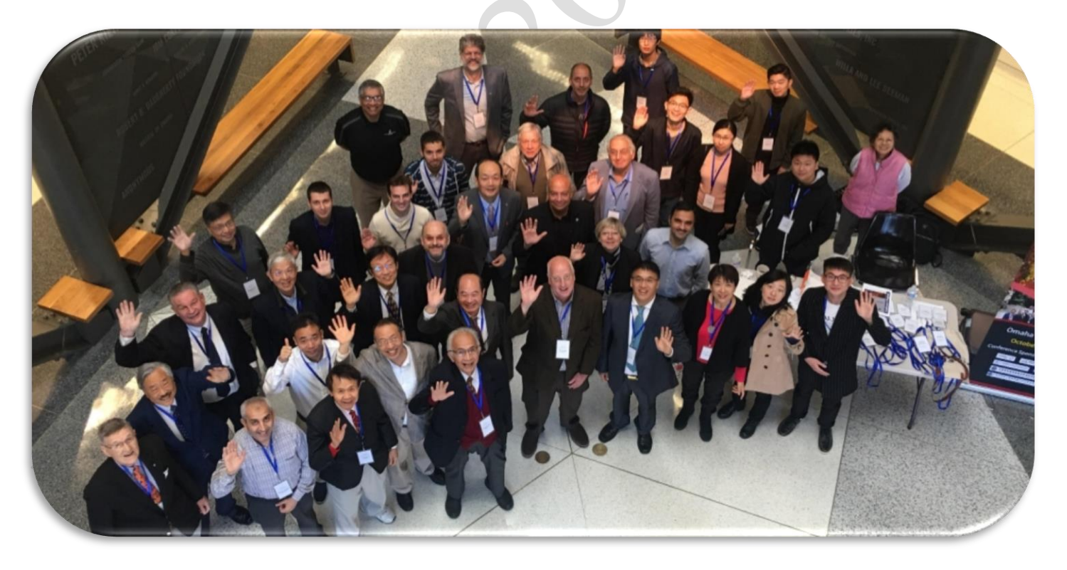
The Sixth International Conference on Information Technology and Quantitative Management, October 2018, Omaha, USA