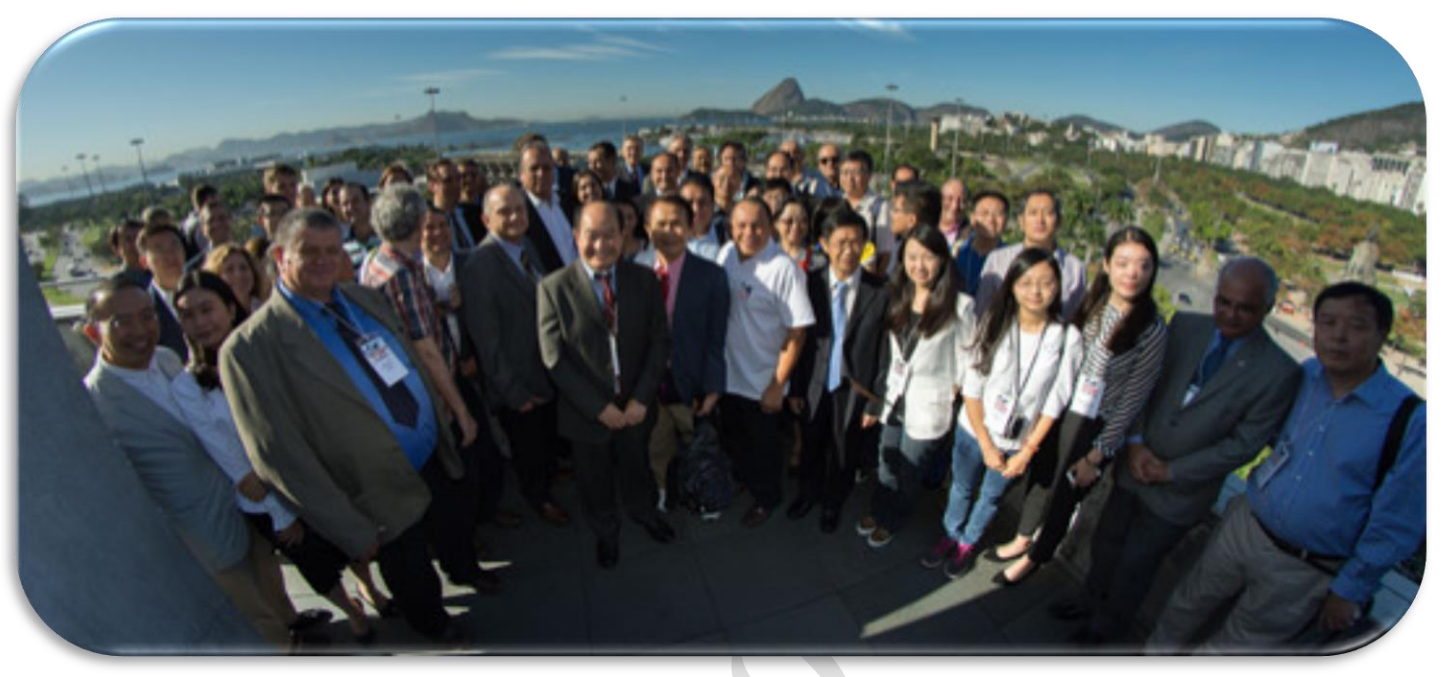
The Third International Conference on Information Technology and Quantitative Management, July 2015, Rio de Janeiro, Brazil