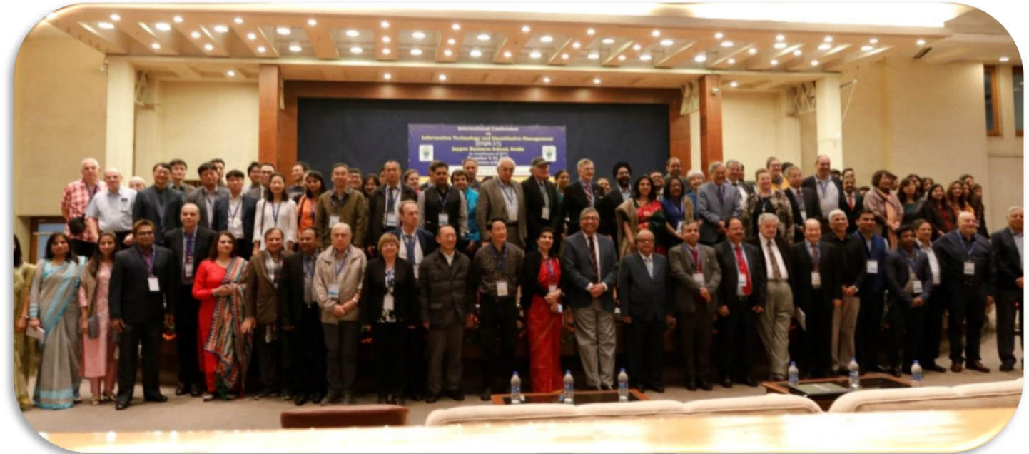
The Fifth International Conference on Information Technology and Quantitative Management, December 2017, New Delhi, India