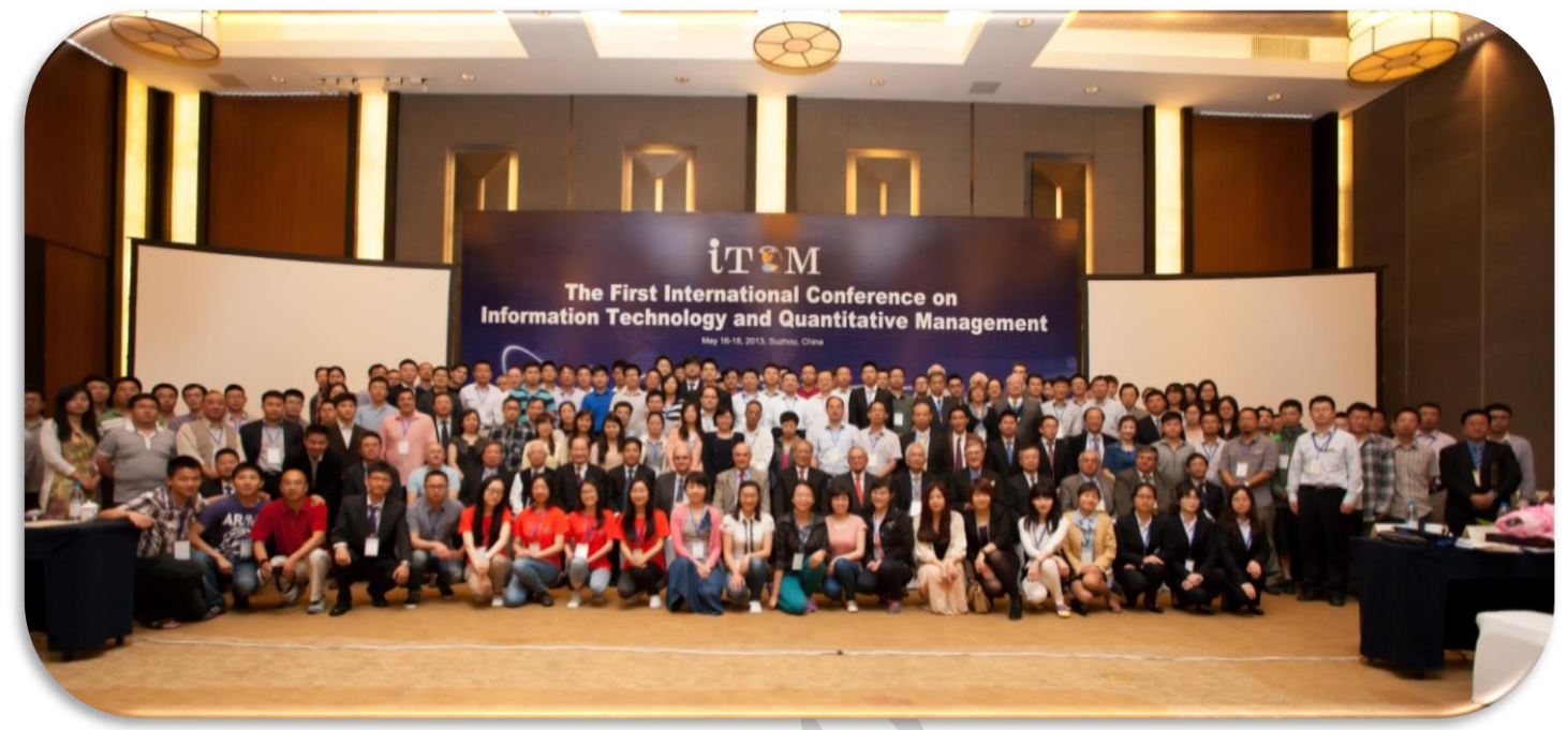
The First International Conference on Information Technology and Quantitative Management, May 2013, Suzhou, China