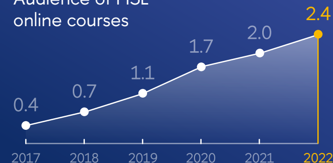
Audience of HSE online courses

29% of disciplines are delivered across all campuses