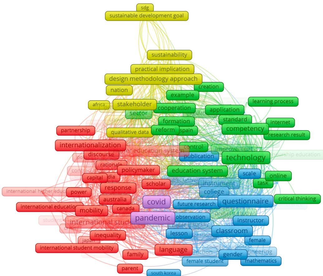
Fig. 3. Thematic clusters for research publications in virtual internationalization of education, 2020-2021.